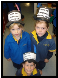
Black Hat Judgement