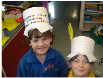
White Hat Facts