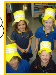
Yellow Hat Good ideas

Last Term the Elephants in Room 9 did lots of learning about and with Thinking Hats.