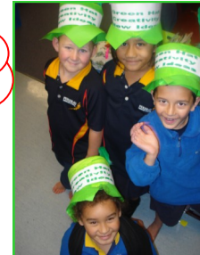
Green Hat Feelings