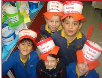
Red Hat Feelings