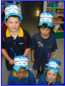
Blue Hat Next Step

These are our thinking hats we made for our assembly.